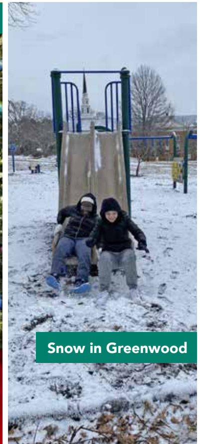
Snow in Greenwood