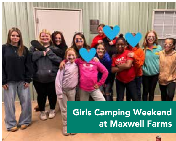
Girls Camping Weekend at Maxwell Farms