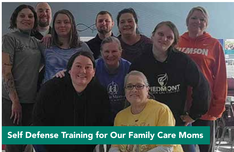
Self Defense Training for Our Family Care Moms