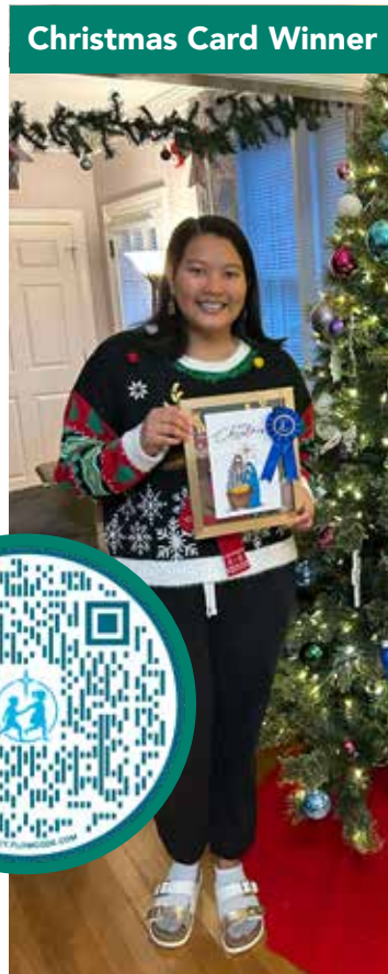
Christmas Card Winner