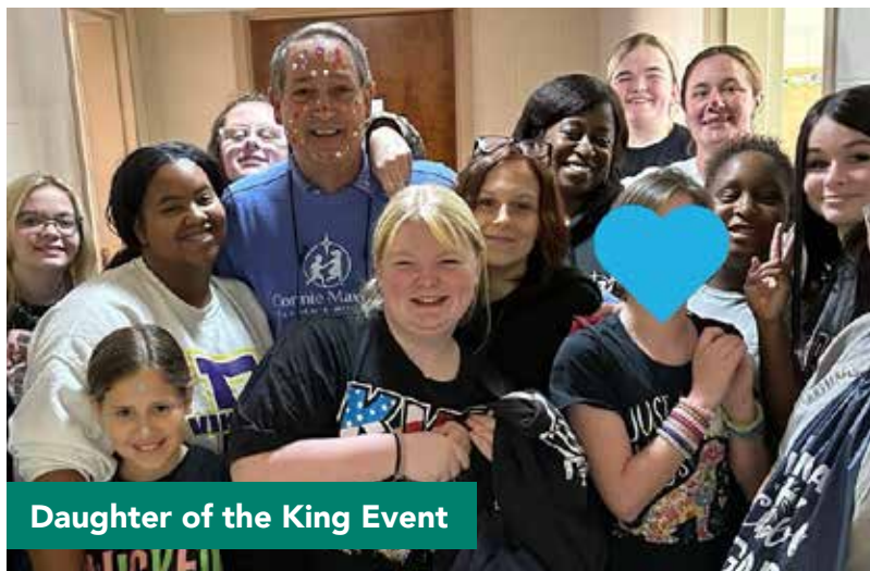
Daughter of the King Event