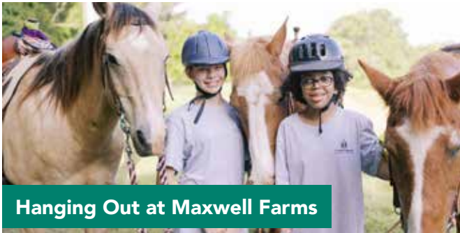
Hanging Out at Maxwell Farms