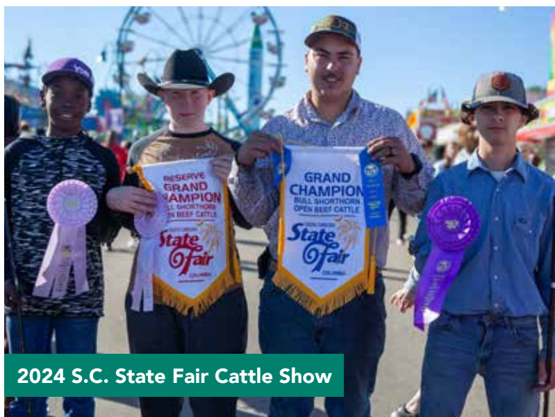
2024 S.C. State Fair Cattle Show

Thank you to our incredible donors that make these special moments possible for our children and families!