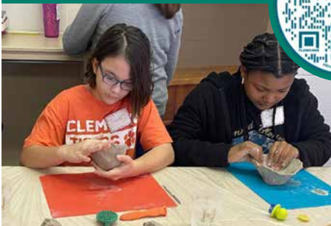
Watch our 2024 Recap Video