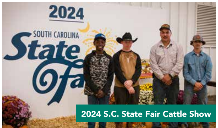
2024 S.C. State Fair Cattle Show