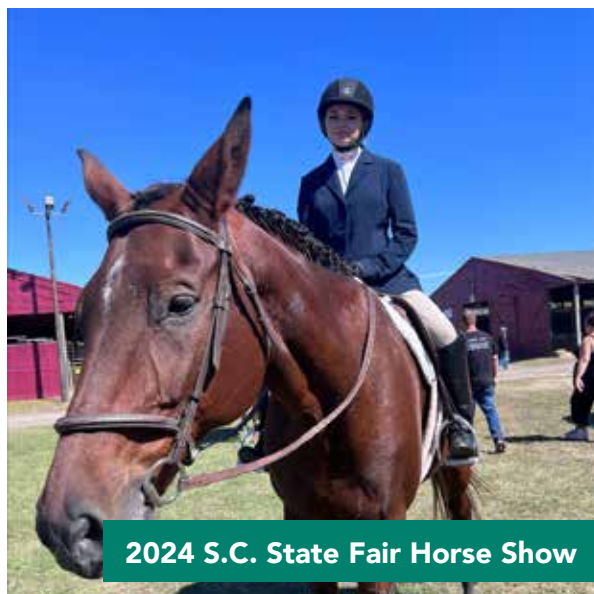
2024 S.C. State Fair Horse Show