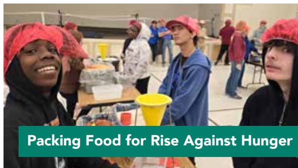
Packing Food for Rise Against Hunger