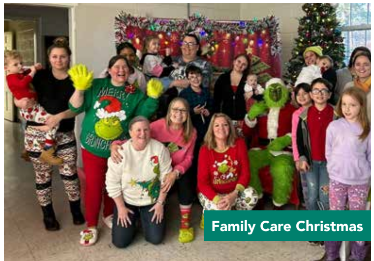
Family Care Christmas