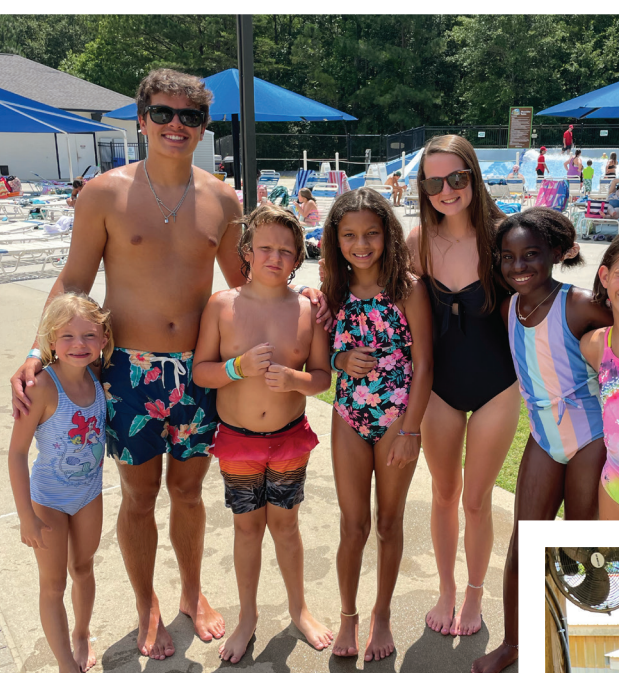
The girls from Turner Cottage took a day trip to Brevard.

Our kids had fun in the sun at Discovery Island in Simpsonville.