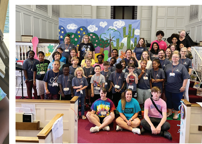
Kids participated in VBS at Connie Maxwell Baptist Church.