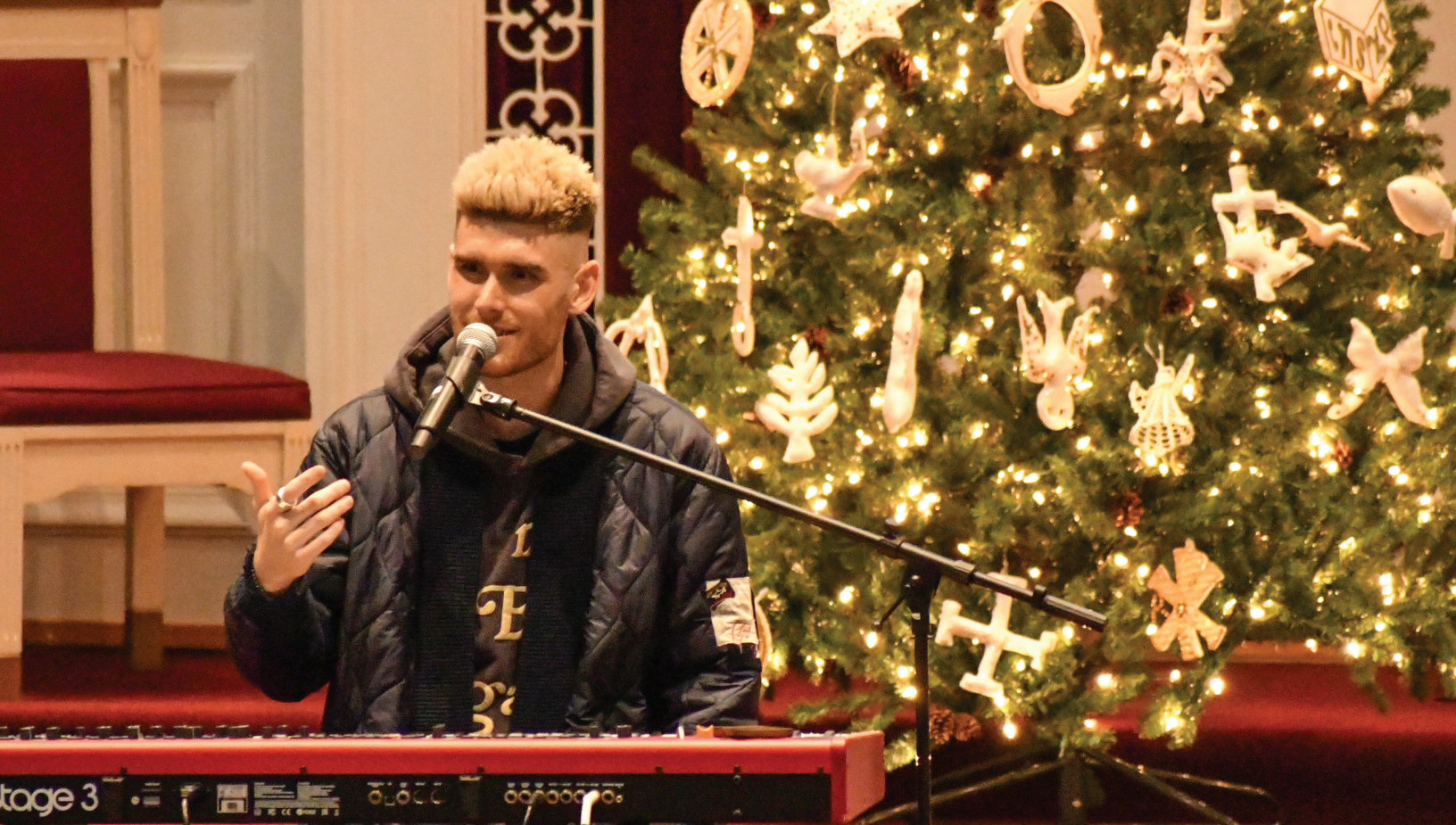
performs inside Connie Maxwell Baptist s enjoyed cupcakes to celebrate the 20 th y of Connie Maxwell Christmas.