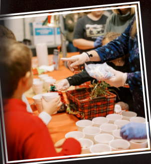
Delicious hot chocolate was served by our amazing staff and volunteers.