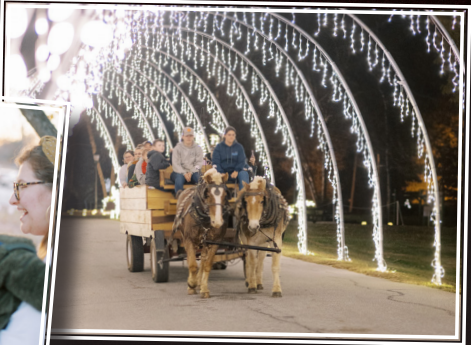
Visitors enjoyed our horse-drawn wagons through campus to view our beautiful holiday lights and decor.