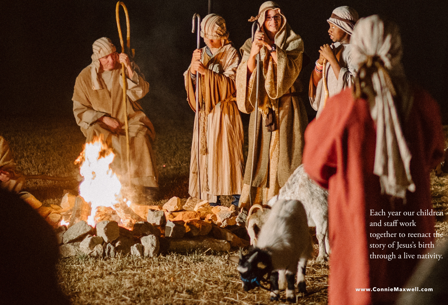
Each year our children and staff work together to reenact the story of Jesus's birth through a live nativity.