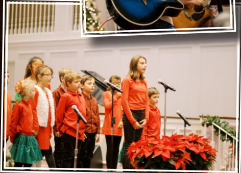
Live concerts were held by our children and special guests to celebrate the birth of Jesus.