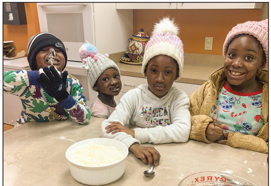
These children at our Adams Campus enjoyed making 'snow cream' after a January snow. Our sources say it was yummy!