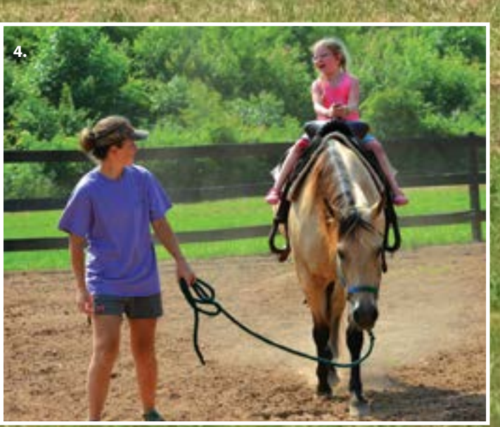
Winter 2019 • The Connie Maxwell 11